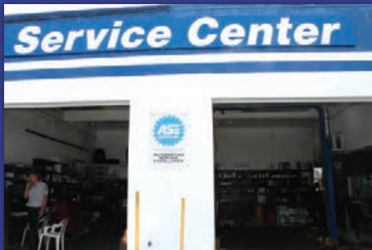
Service Center (Most repairs on the site)