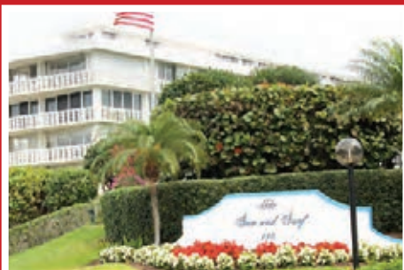
Sun and Surf