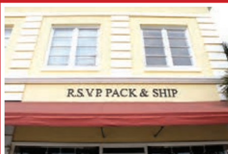
R.S.V.P. Pack & Ship