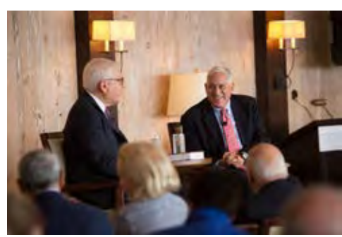
David Rubenstein, Walter Isaacson

a vast collection of art, objects, artifacts and documents and an ongoing collecting program that aims to facilitate a broad grasp of history's enduring importance and its usefulness in finding explanations, causes, and insights.