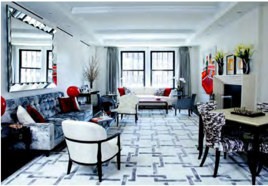
The large patterned silk rug and the custom wallpaper were each designed by Guy Clark, and to add a sense of modern luxury to the vintage sofa, lighting and chairs