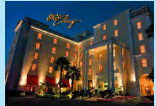
The Colony Palm Beach 155 Hammon Avenue Palm Beach, FL 33480 Telephone: (561) 655-5430 Fax: (561) 832-7318