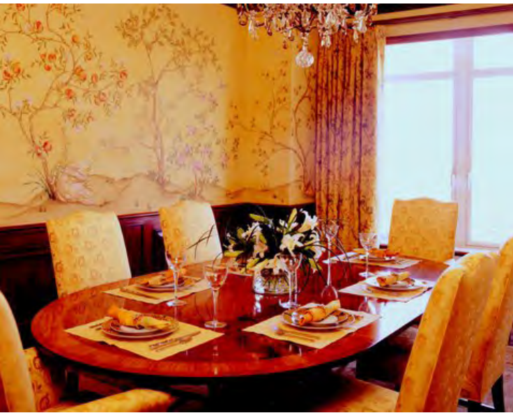
The golden silk drapery fabric inspired the hand painted wall murals that were designed by Guy Clark, and together with the custom boissiere they create a very sumptuous flow to the room