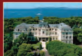
Hotel Du Cap-Eden-Roc Cap d'Antibes