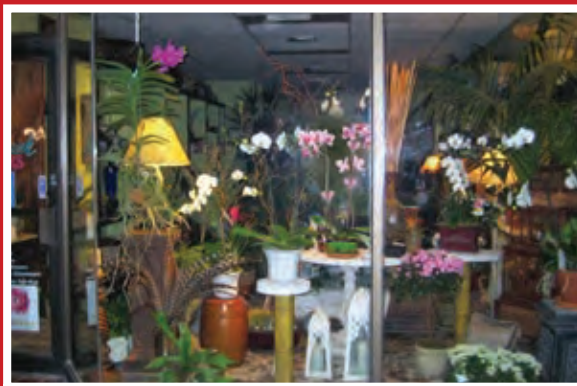
Extra Touch Flowers