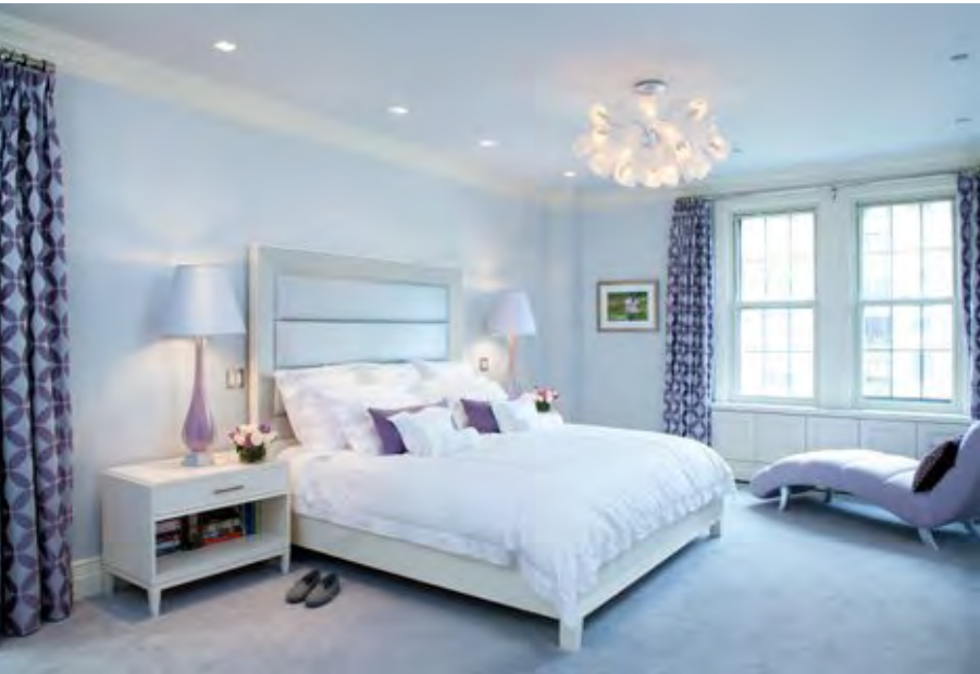
Different tones of lavender and purple mix together perfectly with silver and white for an elegant, tranquil and yet very stylish bedroom. A custom designed bed and bedside tables by Guy Clark complete the look.