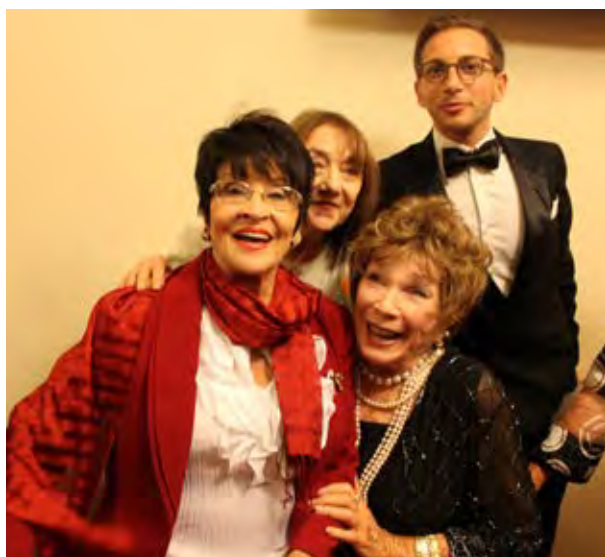
Chita Rivera with Shirley Maclaine