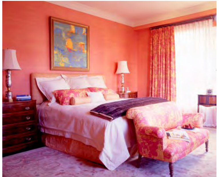
Eleven layers of hand painted wall treatments gave depth and life to the room, while also enhancing the matching colors from the Chinoiserie fabrics and the custom designed artwork.

350 South County Road, by appointment | Cell Phone: 646-262-3758 | www.DecoratorGuy.com