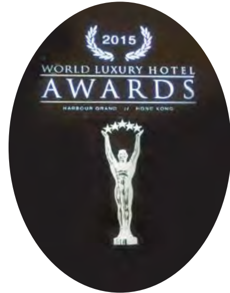
Hotel Heritage in Bruges elected for the 2 nd time in a row for Best Luxury Boutique Hotel in Belgium. The Luxury Hotel Awards were presented in Hong Kong, on October 24 th , 2015.