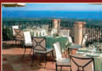
Chateau Saint Martin & Spa Vence, French Riviera