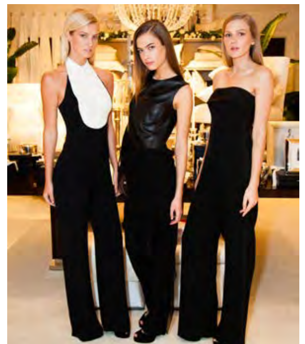
Ralph Lauren Models in Ralph Lauren Pre-Spring 2016 Collection Gowns