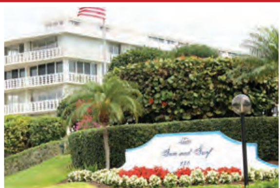
Sun and Surf