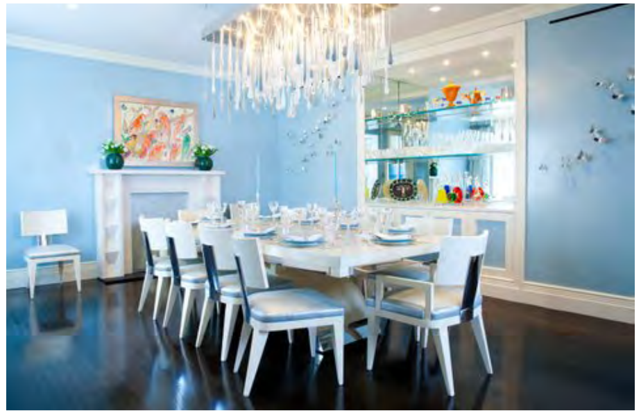
The Guy Clark designed goatskin and steel table and chairs are a perfect marriage to the custom designed chandelier for a dramatic yet sophisticated room