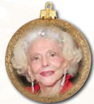
Herme' de Wyman Miro Lifetime Humanitarian Award