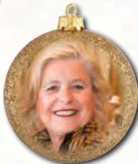
Donna Mulholland Community Service Award