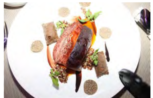
Sauvaki duckling with Spicy Cocoa, Thighs Fondant with Foie Gras, spinach, and quinoa Barbajuan