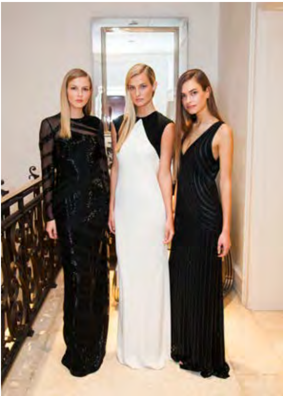
Ralph Lauren Models in Ralph Lauren Pre-Spring 2016 Collection Gowns