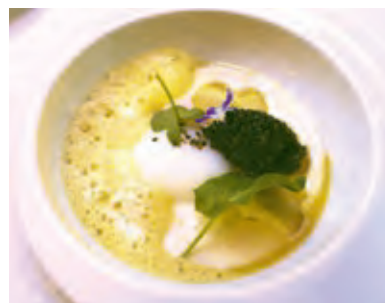
Cassava Egg with Caviar and Maracudja Emulsion (Extraordinary Flavors!)