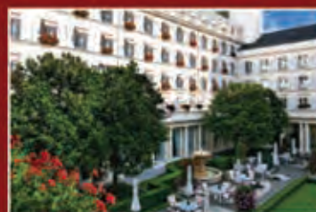
Hotel Le Bristol Paris Paris, France