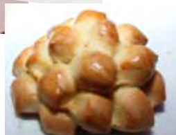
◀ Pain de Brice, Signature Bread, sentimental memories from his childhood