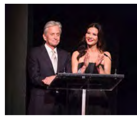
Michael Douglas and Catherine Zeta-Jones