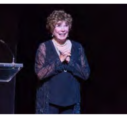
Shirley MacLaine, "Regardless of what I have done, seen, and enjoyed; I think of myself as a DANCER!"