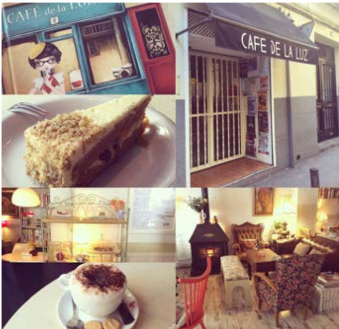
Café de la Luz collage