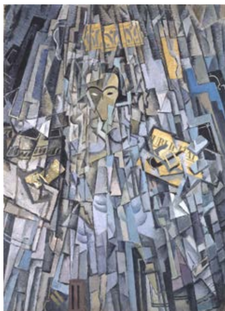
Autorretrato cubista (Cubist Self-Portrait), by Salvador Dalí