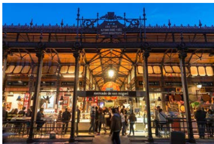
Mercado De San Miguel