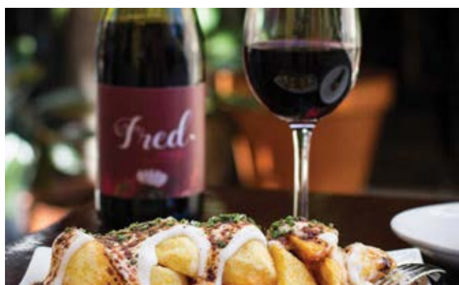
Patatas Bravas at Elsa y Fred

Located in one of the quietest corners of the Barrio de Sant Pere , between a New York air and French character, there is Elsa y Fred . With an offer based on a great variety of tapas and dishes made with products of good quality. This Gastrobar has managed to stand out among the local cuisine. Patatas bravas, also called patatas a la brava or papas bravas, is a dish native to Spain, often served as a tapa in bars. The rendition that I enjoyed at Elsa y Fred Gastrobar was heavenly!