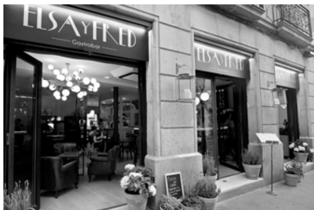
Elsa y Fred Gastrobar