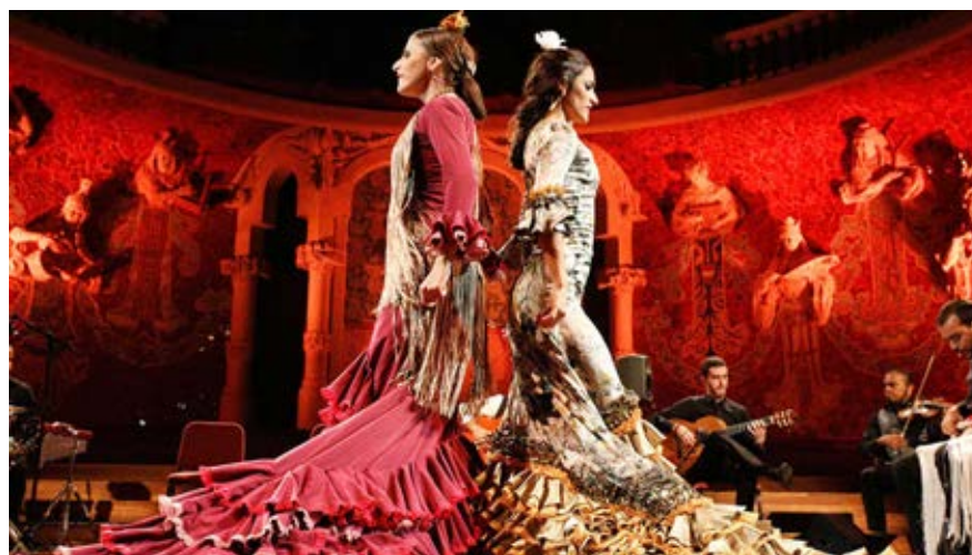
Gran Gala Flamenco