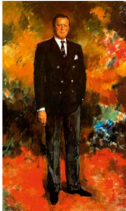
Portrait of Baron H.H. Thyssen-Bornemisza, by Ricardo Macarrón

In 1985, the Baron married Carmen "Tita" Cervera (a former Miss Spain 1961) and introduced her to art collecting. Cervera's influence was decisive in persuading the Baron to relocate the core of his collection to Spain where the local government had a building available next to the Prado. The Thyssen-Bornemisza Museum officially opened in 1992, showing 715 works of art. A year later, the Spanish Government bought 775 works for $350 million.