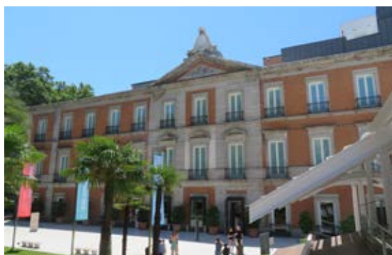
Site of the Retiro and the Prado in Madrid