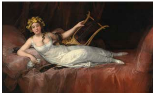
La Marquesa de Santa Cruz, by Francisco de Goya

The Museo del Prado opened to the public on 19 November 1819 as a Royal Museum of Painting and Sculpture. In 2019, the museum celebrates its 200 th Anniversary!