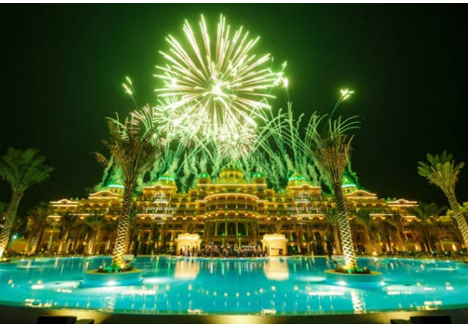
Fireworks over Emerald Palace Kempinski Dubai