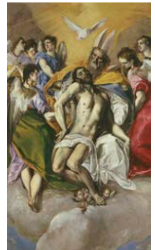
La Trinidad, by El Greco