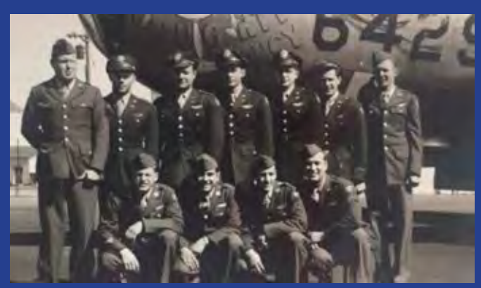
Bagels Over Berlin

Opening Night tickets are $20 for Film Society members and $25 for nonmembers. For the rest of the Festival, film tickets range from $7 to $15 for Film Society members and $9 to $18 for nonmembers. Tickets are available for purchase through the website pbjff.org or by calling 877-318-0071.