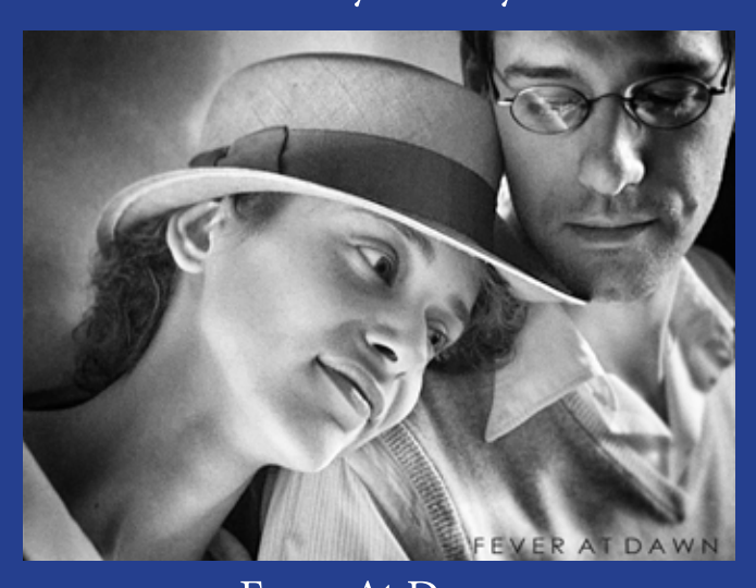
Fever At Dawn