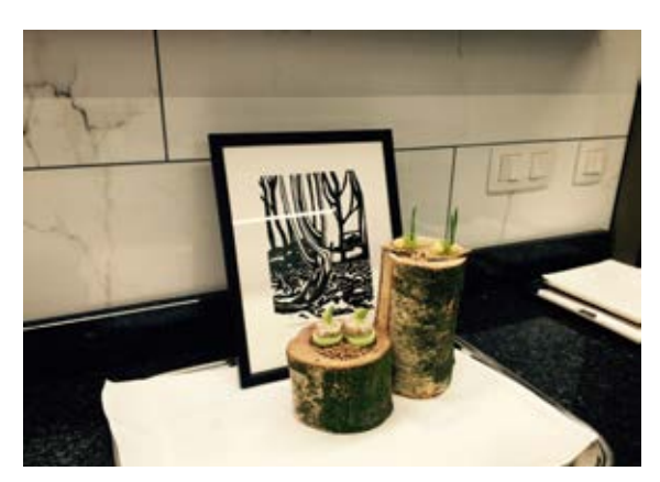
Salad of Atlantic mackerel, meringue of celery, marinated cucumber