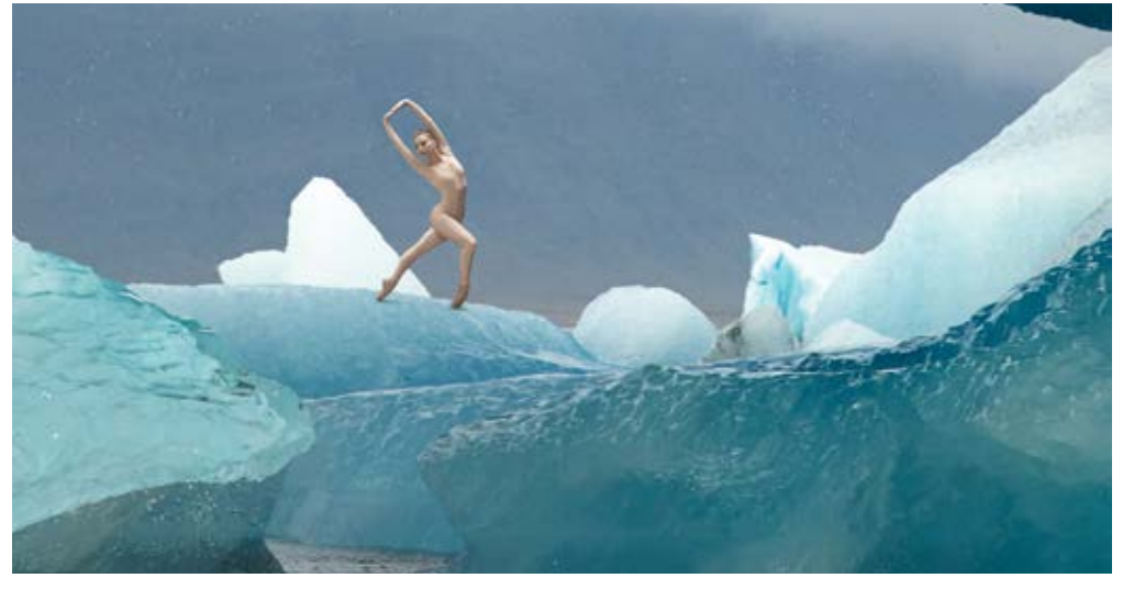
MCB GALA, A fairytale, ice-kissed evening in celebration of the marvelous dancers of Miami City Ballet, and the world

Miami City Ballet's Annual Gala had the distinction of being the firstever gala hosted at Miami Beach's new cultural cornerstone Faena Forum. The exclusive black-tie affair showcased Miami City Ballet dancers in an exquisite and never-before-seen setting. Inspired by the world premiere commission of Alexei Ratmansky's The Fairy's Kiss, the gala transformed the Rem Koolhaas/ OMA designed Faena Forum space into a frozen winter wonderland where guests experienced an evening with cocktails, dinner, dancing and artistic prowess.