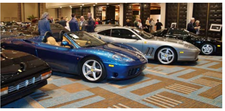
Selection of Ferraris

The Finest - the new and innovative auction house with customized buying opportunities for online and onsite buyers - will next focus on their inaugural online auction via their Danbury headquarters followed by a virtual auction in Hershey, PA at The Elegance at Hershey in June.