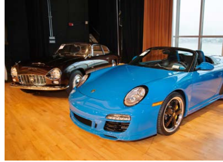
200 Porsche 911 Speedster

About The Finest Automobile Auctions: The Finest Automobile Auctions is a new Auction House focused on delivering the finest experience for collector car enthusiasts and offers customized buying opportunities for onsite and online buyers.