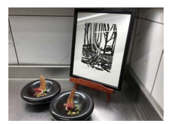
Chia seed cracker, cream of chickpea