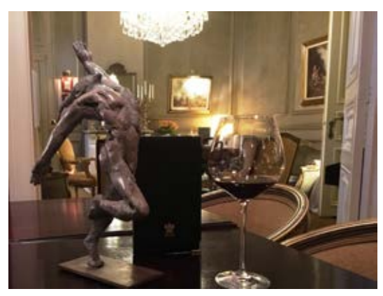
Le Mystique Food Art