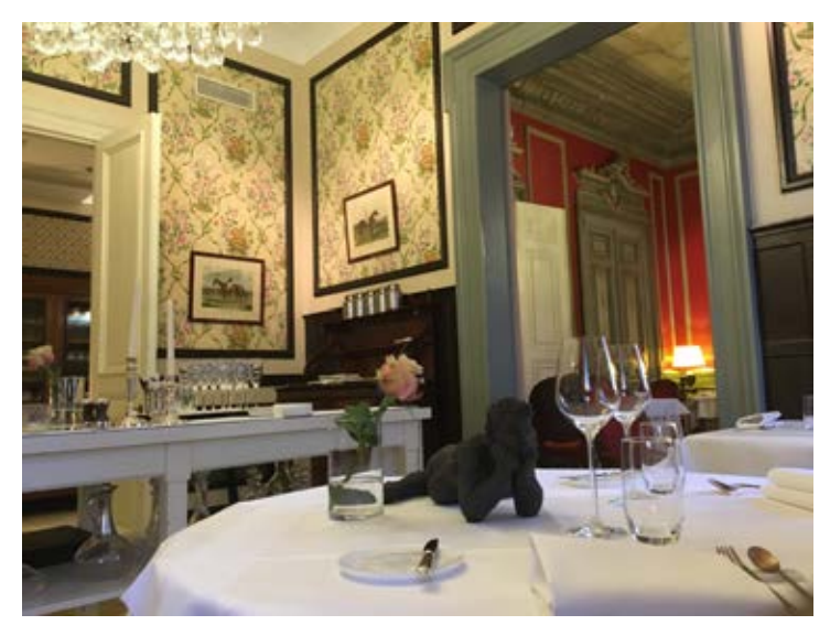
Sculpture: Ancre by Virgnie Venticinque