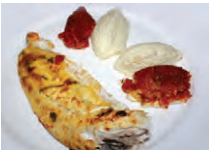
Loup de mer, Daurade Royale (sea bass, Glit head bread)