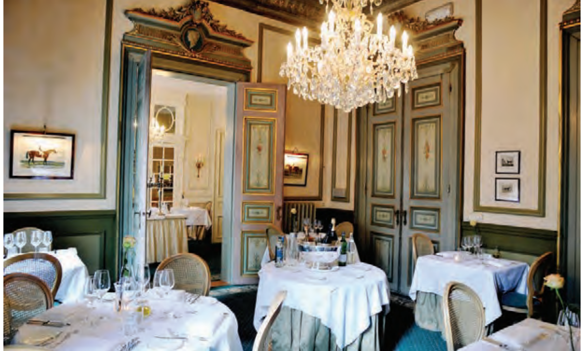
Heritage - Restaurant Le Mystique 3