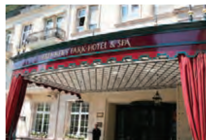
Brenner's Park Hotel & Spa Baden-Baden, Germany