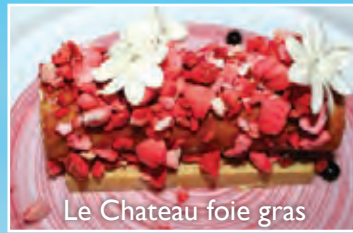
Le Chateau foie gras