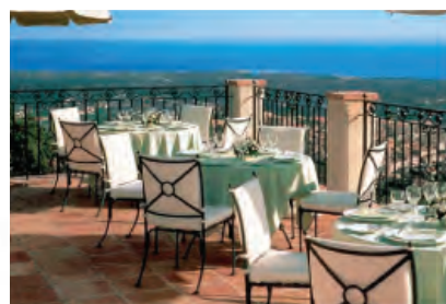
Chateau Saint Martin & Spa Vence, French Riviera