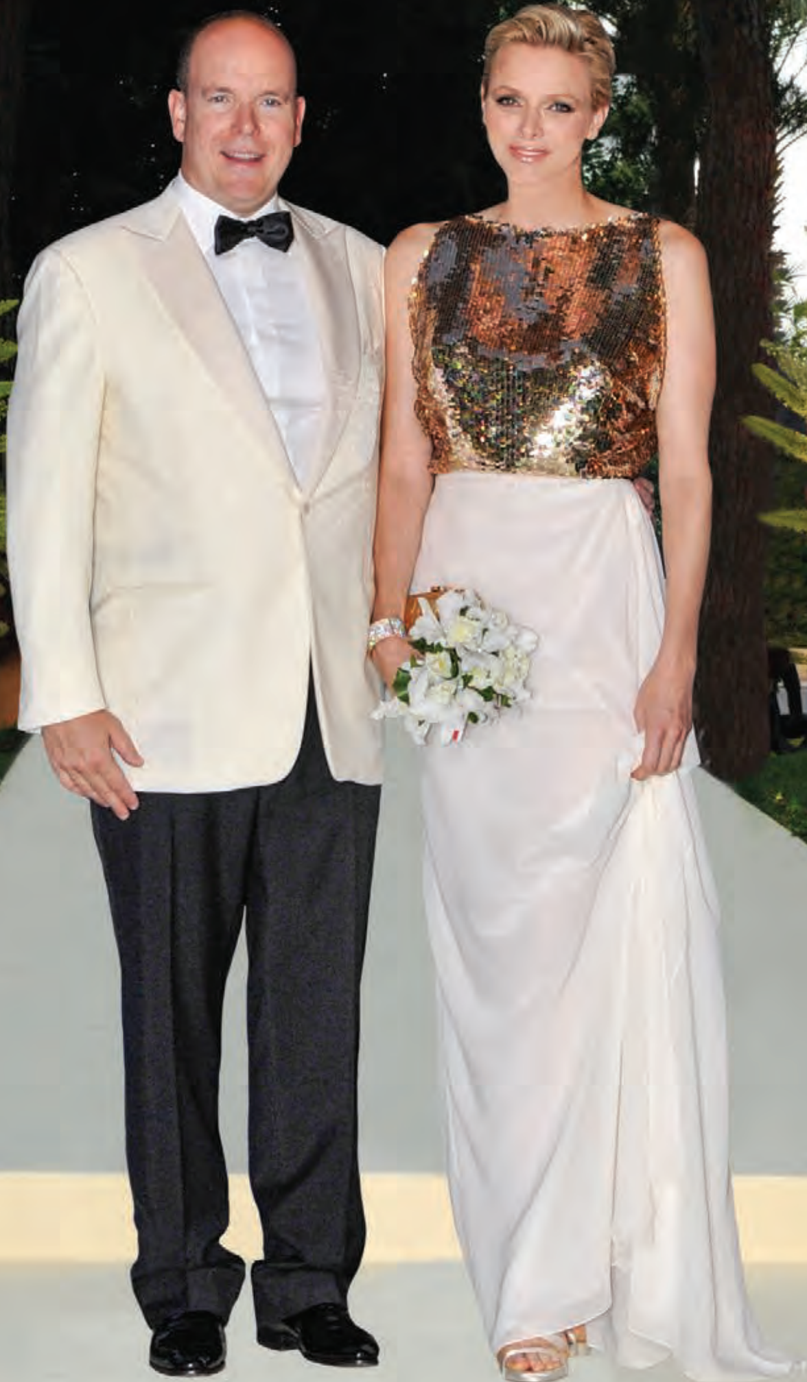
S.A.S. Prince Albert II and S.A.S. Princesse Charlène

Friday 3 August, 2012 | Salle des Étoiles – Sporting Monte-Carlo