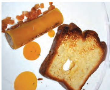
Duck foie gras passion, peach chutney with Sicbuan pepper