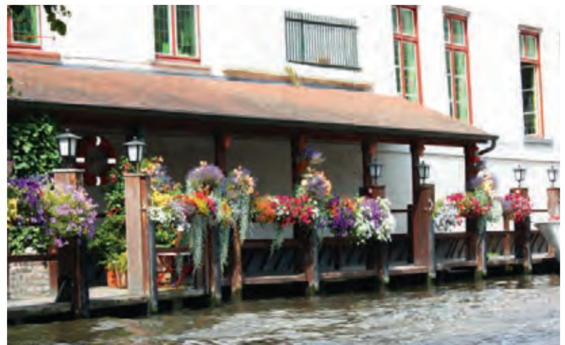
flowers & canal