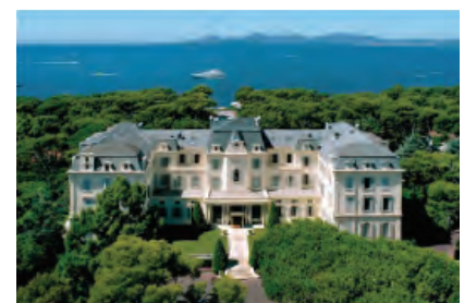
Hotel Du Cap-Eden-Roc Cap d'Antibes