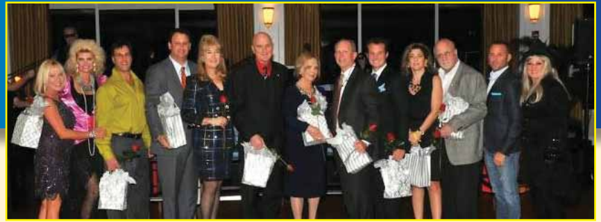
Magnificent 9 Leaders and Magnificent Friend Award Recipients