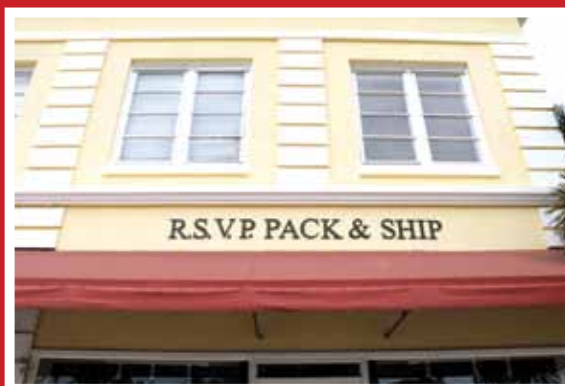
R.S.V.P. Pack & Ship