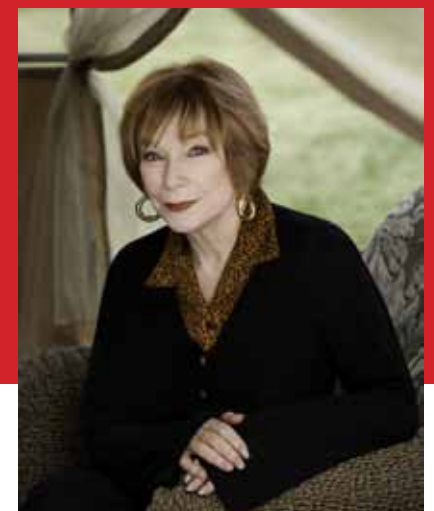
Honoree: Shirley MacLane