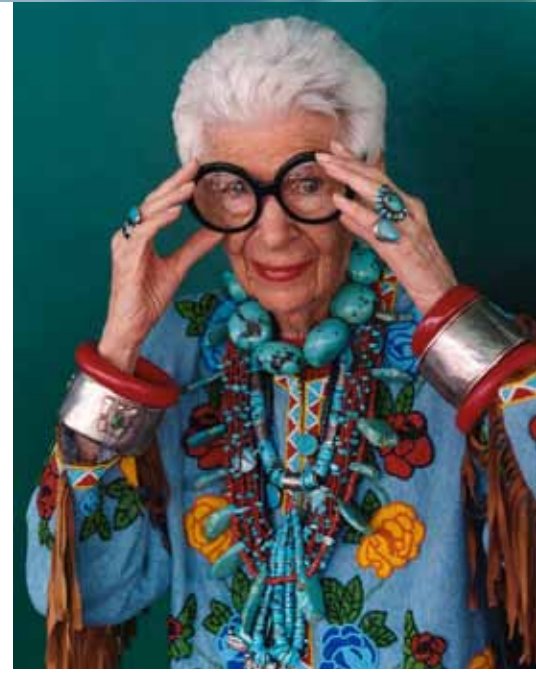
Fashion Icon and honoree Iris Apfel.