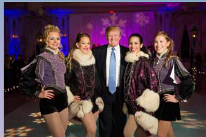
Donald Trump with the Performing Ice Skaters