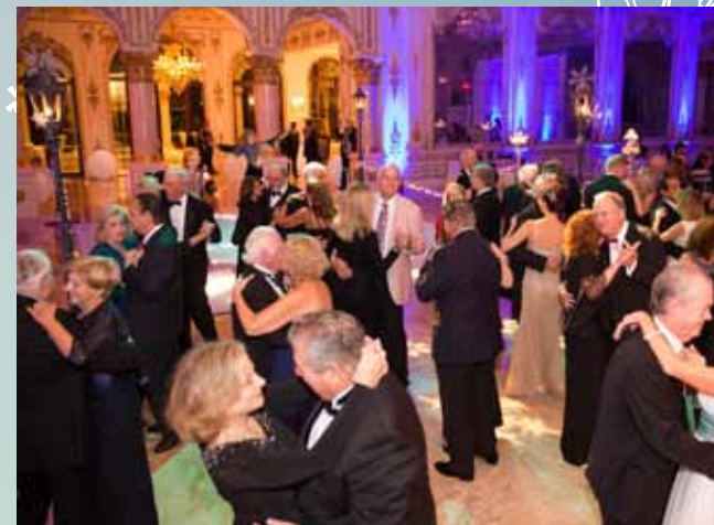
Dancing to the Live Band in the 'Ice Palace'