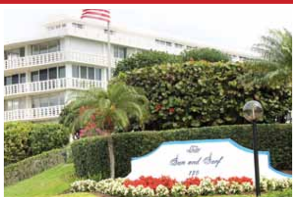
Sun and Surf