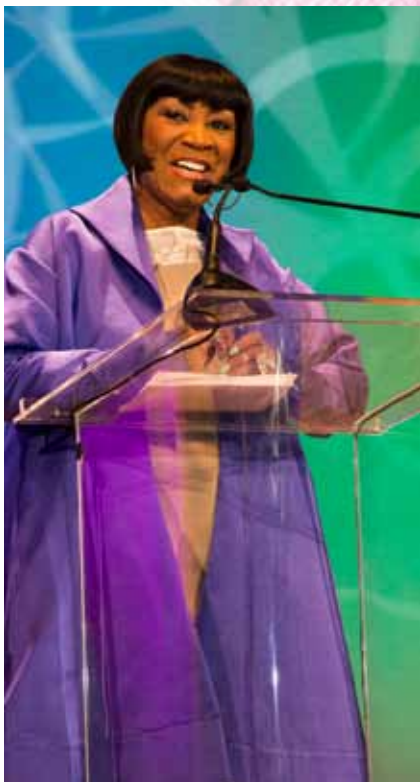
International star and presenter Patti LaBelle