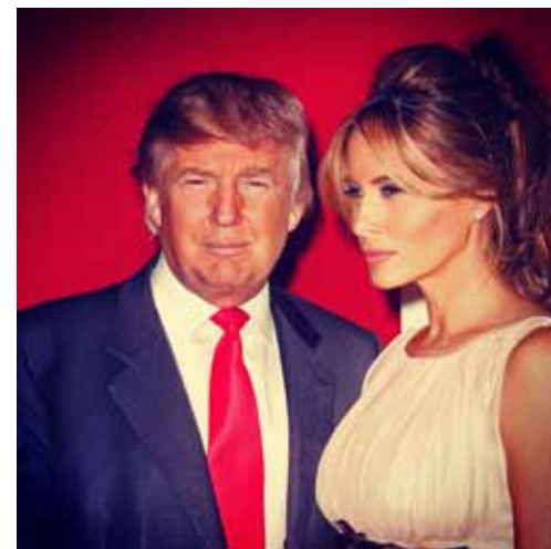
Donald and Melania Trump

"We look forward to an evening where the world comes together in