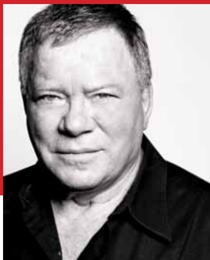
Honoree: William Shatner