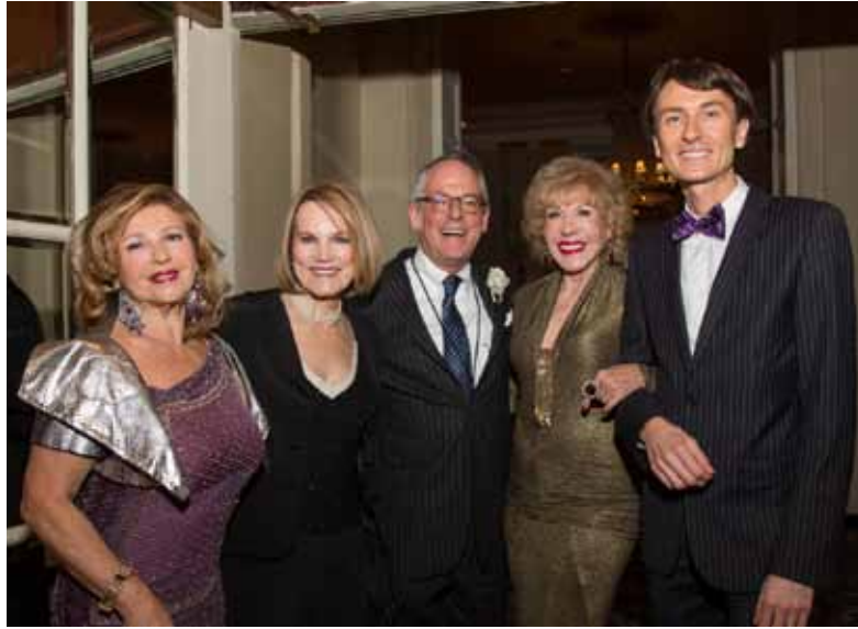
Palm Beachers arriving at the Waldorf