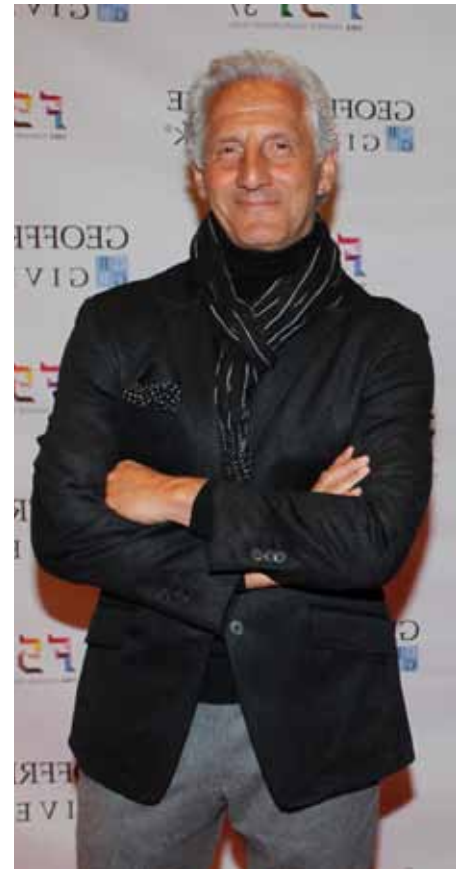
World renowned designer and award presenter Joseph Abboud