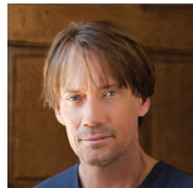
Kevin Sorbo American actor best known for the roles of Hercules in Hercules: The Legendary Journeys, Captain Dylan Hunt in Andromeda and Kull in Kull the Conqueror.

Most may not realize that stroke kills more than 137,000 people a year. It's the No. 4 cause of death in the U.S. with approximately 795,000 Americans suffering a new or recurrent stroke each year. That means, on average, a stroke occurs every 40 seconds. Additionally, Americans will pay about $73.7 billion in 2010 for stroke-related medical costs and disability. For more