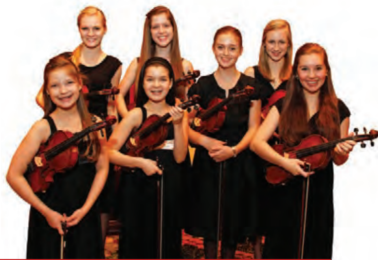
FiddleWorks Keili Kids Orchestra